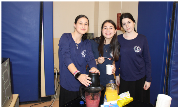
Wellness Week at UO & YOC

Luke's mom tells him not to swim too far, but the waves feel good, the sun is warm, and the shore is close. He dives deep, arms strong. When he comes up, the beach is gone. Just blue. He spun, heart fast. No boats. No land. Just sea. A splash. He turned. A boy his age floats near. Pale, with dark eyes. "Lost?" the boy asks. Luke gulps. "Yeah." The boy grins. "Me too." He holds out a hand. Luke takes it. Cold. A wave rolls and Luke is gone. On the beach, his mom calls his name. ■