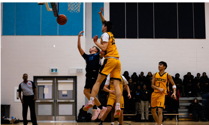
Senior Knights Playoff Game