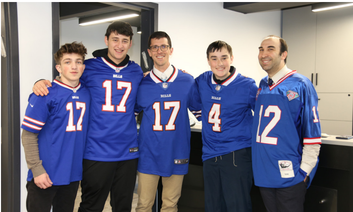
Football Friday at YOC