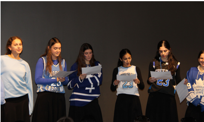
Colour War at UO