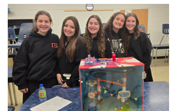
The BAS Safe Teams that competed in Montreal.